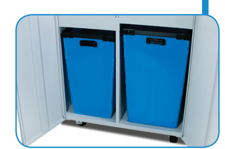
Lifetime guaranteed waste bins made of heavy-duty molded plastic

Formax - New Hampshire, USA www.formax.com