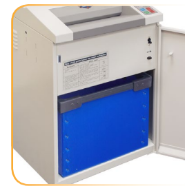
Heavy Duty Waste Bin