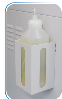
Optional EvenFlow™ Automatic Oiling System

*Capacity varies depending on paper and power supply